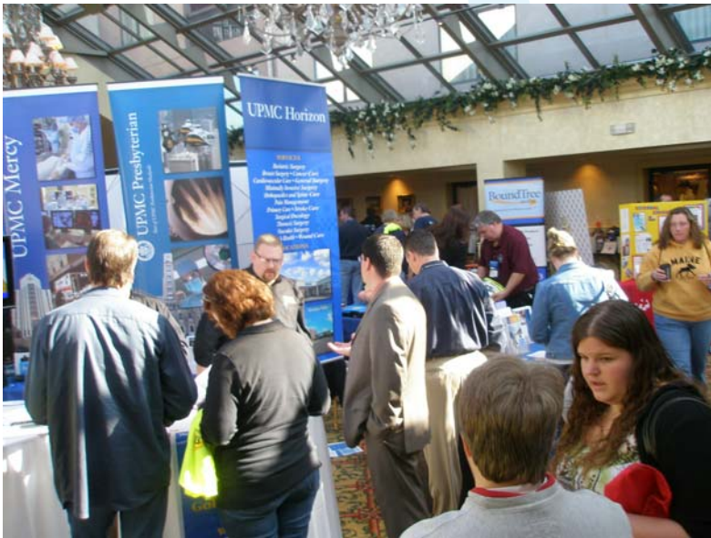
Symposium 2010 Vendor Area @ Ambassador Conference Center, Erie

The 2011 annual education conference, Symposium 2011, planning is moving into high gear. EMMCO West staff members have been working on this year's event over the past several months. Last year's symposium had the largest number of vendors and participants yet. And this year's Symposium hopes to match or exceed last year's successes.