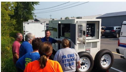
70K Generator Training