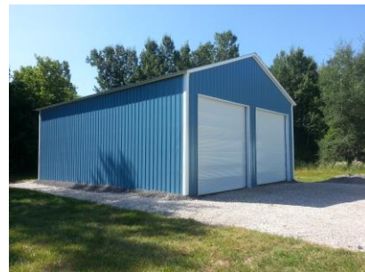
New Preparedness Equipment Building Meadville & UPMC Horizon