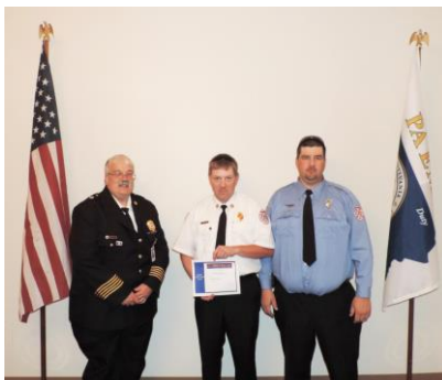
2016 Bronze QI Award