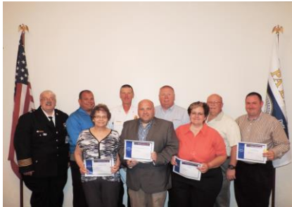
2016 Gold Level QI Award