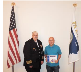
2016 Silver QI Award