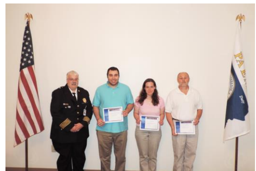
2016 Honorable Mention QI Award