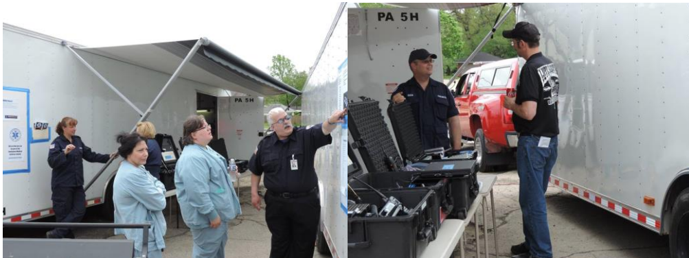
2016 Sharon Regional Hospital Preparedness Fair