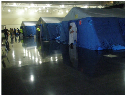
50 patients housed within mobile hospital