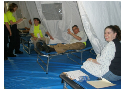
Just before meal time for patients