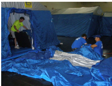
Strike Team Members Inflating Tents